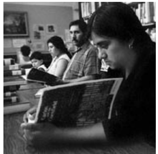
Participants in a bilingual Motherread and Fatherread Program.

Our initial investment in training renews itself year after year as the facilitators work with groups of adults who, in turn, share with their own families an appreciation for literature in daily life. Since implementing Motherread and Fatherread, the VFH has expanded its audience and venues for humanities programming.