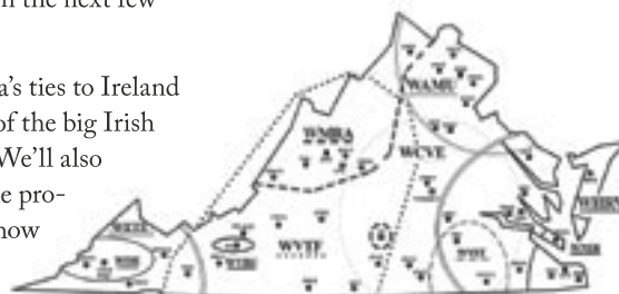
Map of the WGR broadcast area by station range. For complete listings, visit www.virginia.edu/vfh/wgr

To read the complete interview, and to listen online to the show, please visit the With Good Reason website at www.virginia.edu/vfh/wgr .