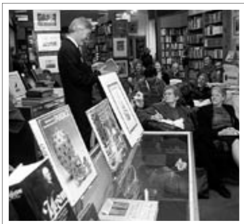
Programs about the value and pricing of rare books always draw a capacity crowd at Blue Whale Rare Books.