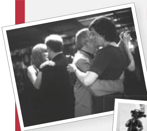
"The Last Time" (above), a film by Conor Horgan, will be showcased at Re-Imagining Ireland .