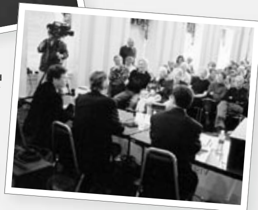
A panel at VABook! 2002 (right) discusses integrity in public life.