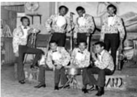
Members of the Ethiopian band Wallias, at Massawa on the Red Sea, ca. 1973. Most of these musicians now live in Virginia.